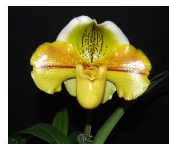
Paph. Highland Gold