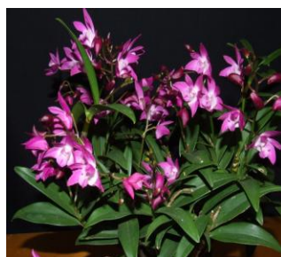
Den. Jonathans Glory