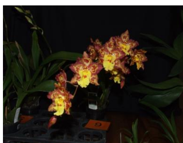
Wils. Tiger Brew