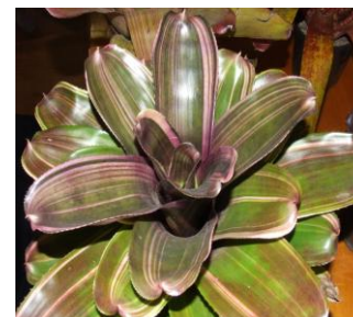
Neo. Downs Autumn