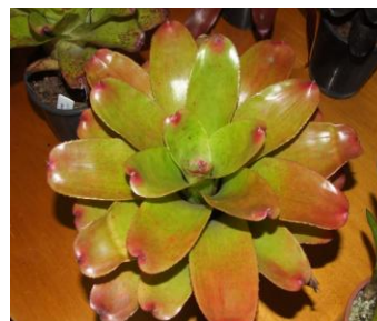
Neo. Mandarin Miss