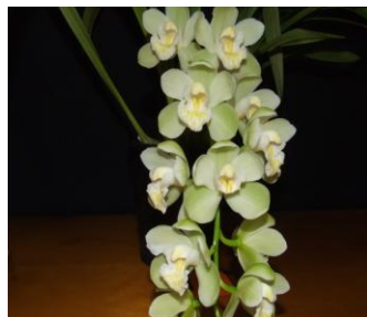
Cym. Pure Sarah 'Starburst'