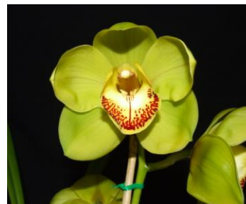
Cym. Winter Showers x Green Spectacle