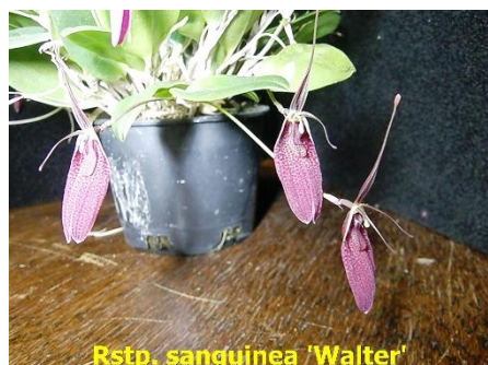
Rstp. sanguinea 'Walter'