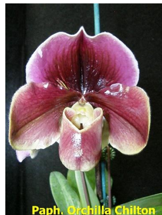
Paph. Orchilla Chilton