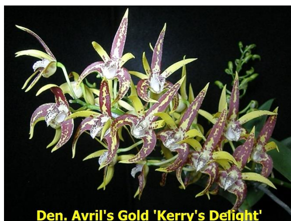
Den. Avril's Gold 'Kerry's Delight'