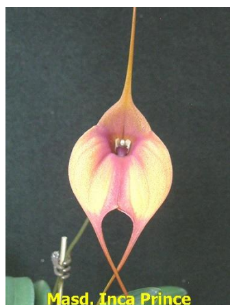
Masd. Inca Prince