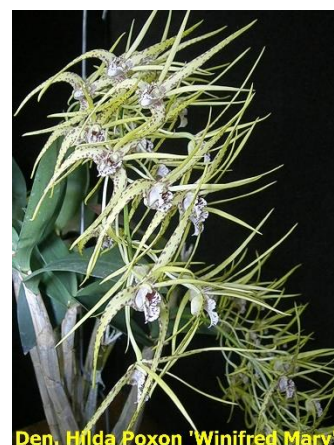
Den. Hilda Poxon 'Winifred Mary'