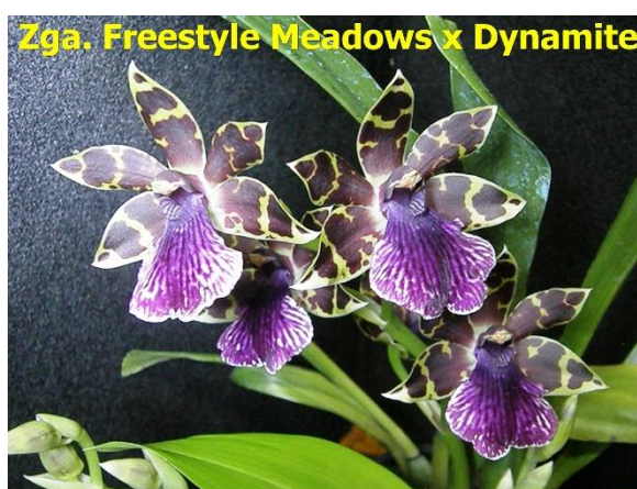
Zga. Freestyle Meadows x Dynamite