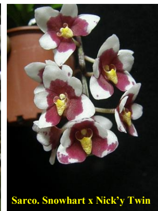
Sarco. Snowhart x Nick'y Twin