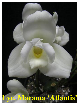
Lyc. Macama 'Atlantis'