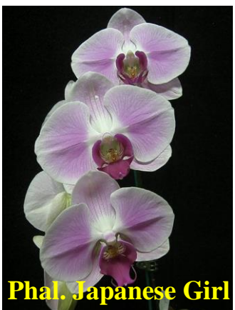
Phal. Japanese Girl