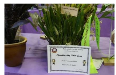
Champion Any Other Genus