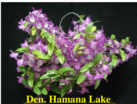
Den. Hamana Lake