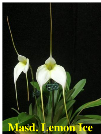
Masd. Lemon Ice