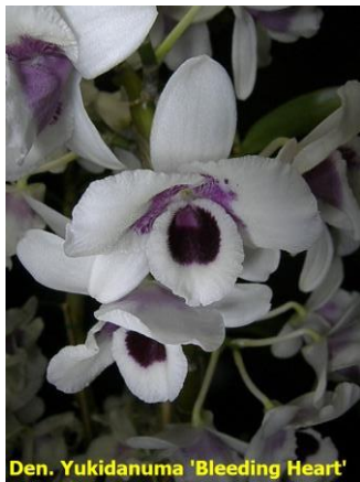
Den. Yukidanuma 'Bleeding Heart'