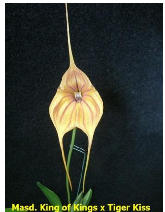
Masd. King of Kings x Tiger Kiss