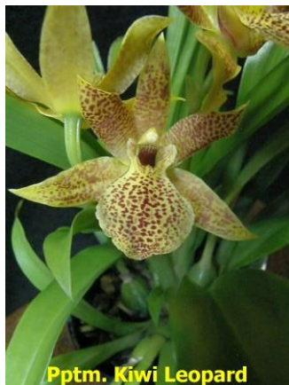
Pptm. Kiwi Leopard