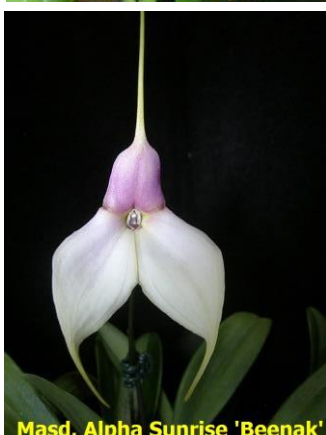
Masd. Alpha Sunrise 'Beenak'