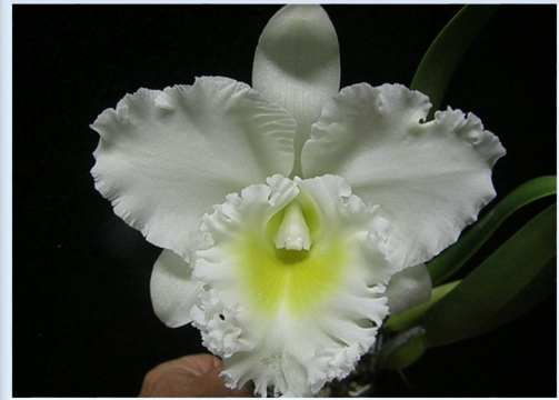
Rlc. Dal's Passion x Rlc. Redland