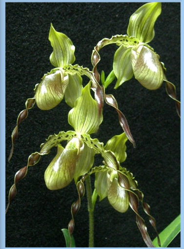
Paph. Neeri-Gold 'Scottie'