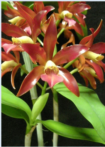
Ctt. Chocolate Drop 'Koddo'