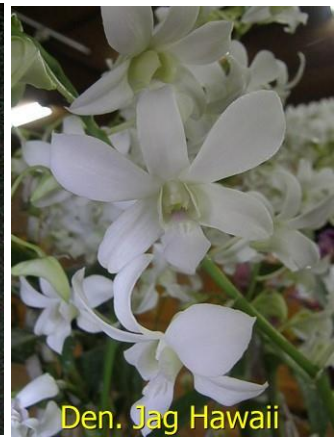
Den. Jag Hawaii