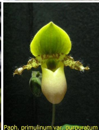
Paph. primulinum var. purpuratum