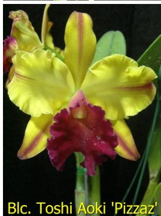
Blc. Toshi Aoki 'Pizzaz'