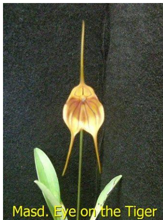
Masd. Eye on the Tiger