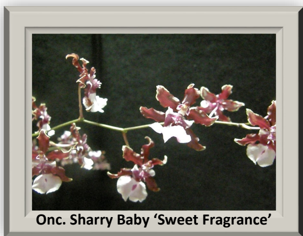
Onc. Sharry Baby 'Sweet Fragrance'