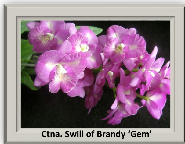
Ctna. Swill of Brandy 'Gem'