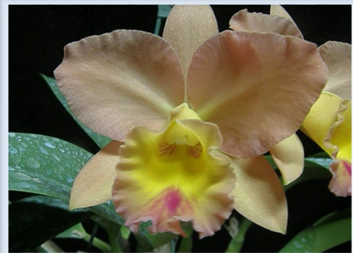
Rlc. Dal's Tradition 'Prestige'

Pots, fertiliser, bark and accessories are available from Heather Guppy at 43 Noll Street, Kearneys Spring.