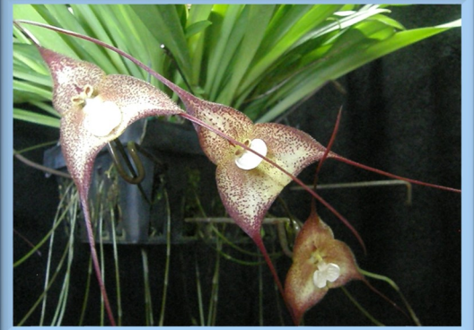
Drac. Swamp Fox