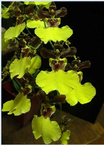
Gom. Dot Burn