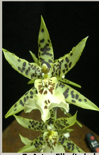
Z. Artur Elle 'Luke'