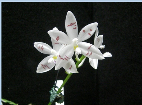
Phal. tetraspis var. spot