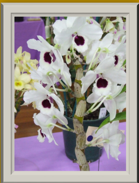
Den. Yukidaruma 'King'