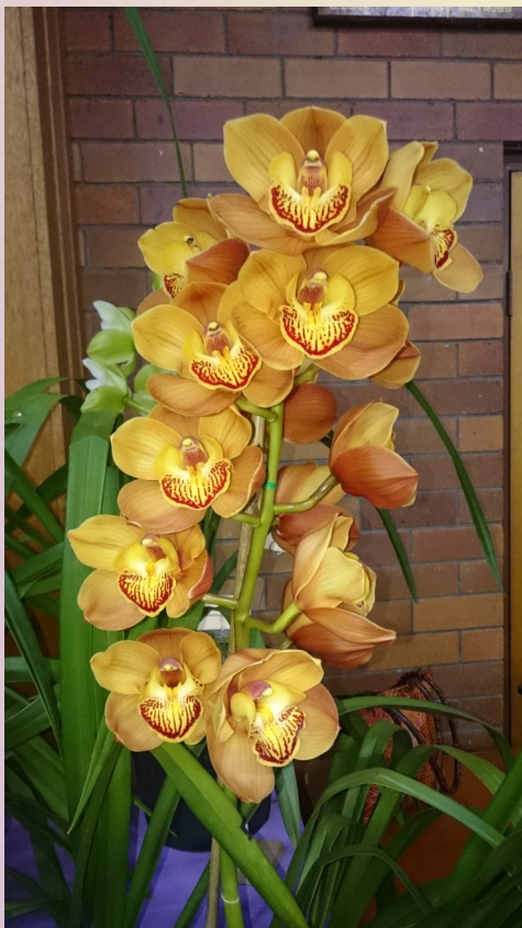
Cym. (Foxfire Amber x Dural Gold)