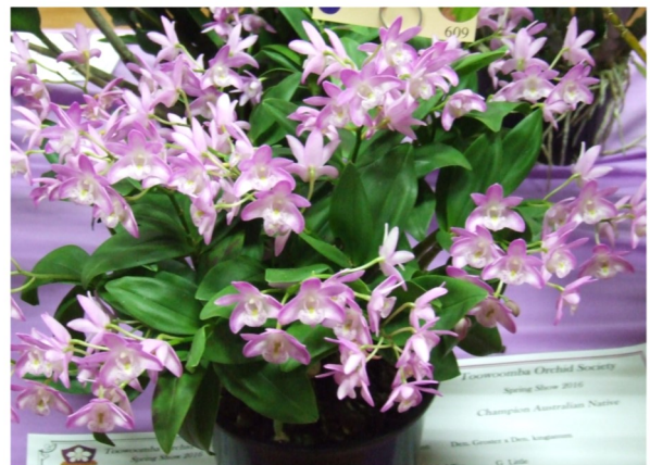
Den. Groster x kingianum