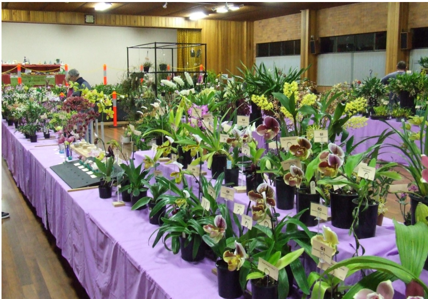
Some of the Paphiopedalum alliance and cut flowers