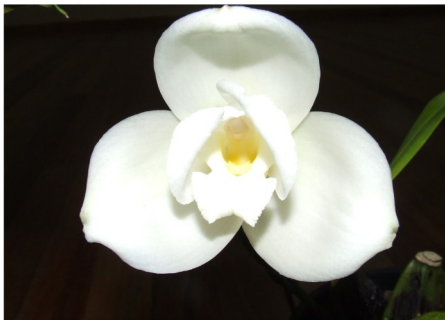
Lyc. Macama 'Atlanta'