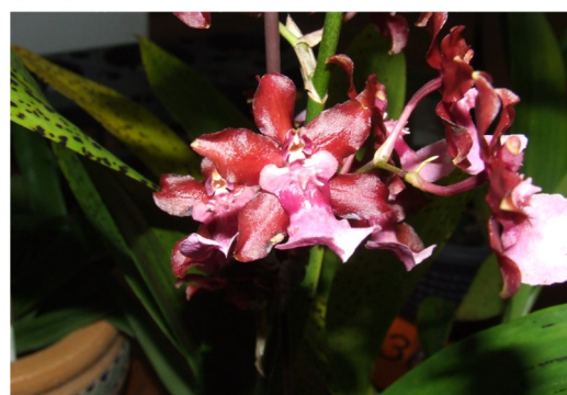
Onc. Sharry Baby 'Sweet Fragrance'