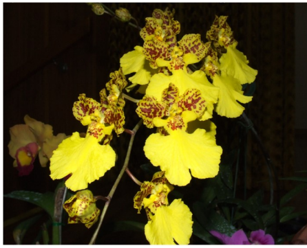
Zel. Anzac Cascade 'WOC'