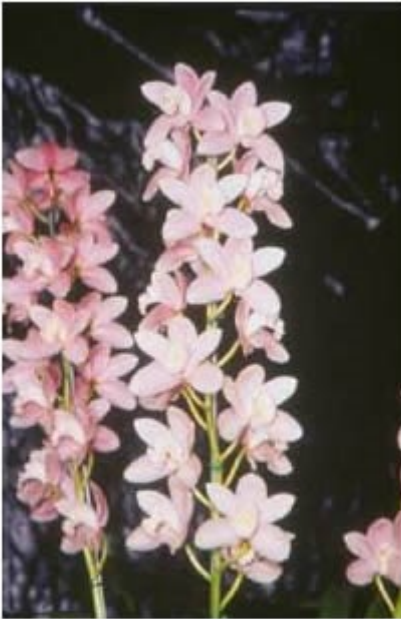
Cymbidium Without Peer 'Soft Touch' HCC/OSCOV

For the benefit of novice growers I should explain that a back-bulb is a bulb that has lost all its leaves, hopefully because of age rather than disease. When a cymbidium is repotted, it's desirable to remove these leafless bulbs, preferably by severing the rhizome linking them to the rest of the plant. It's best to use a sterile knife or scissors, but some growers simply twist the connecting rhizome by hand until it breaks. Having removed the back-bulbs, how do you 'strike' them and why? 'Striking' is jargon for encouraging the back-bulb to produce new growth from incipient leaf nodes, which are mostly located near the base of the bulb.