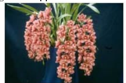
Cymbidium Do Wop 'Woopie' HCC/OSCOV

Some back-bulbs strike more rapidly than others. If a leaf growth appears within three months you're doing well, while six months would be average. If there's no sign of growth within twelve months all but the super-optimist should give up (there are always a few back-bulbs each year that fail to strike). Generally, roots do not appear until the leaf growth is several inches tall, and there is no point in applying slow-release fertiliser until this stage is reached. If you're keen, there may be some benefit in applying liquid fertiliser to the foliage at an earlier stage as liquid fertilisers are absorbed by leaves as well as by roots.