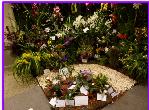
Mingara Orchid Society Display