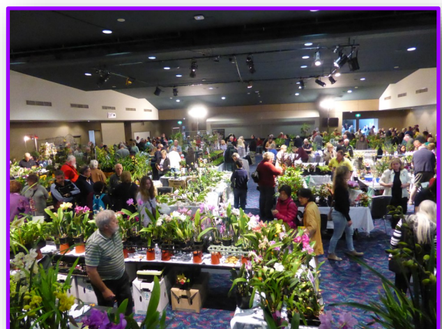
Mingara Sales Area