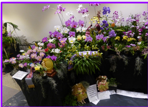
Mingara Show Champion Display