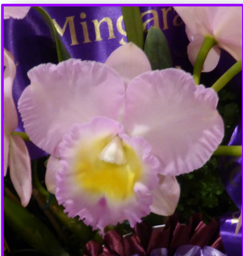
Grand Champion - C. Lakehaven Pearl 'Colleen'