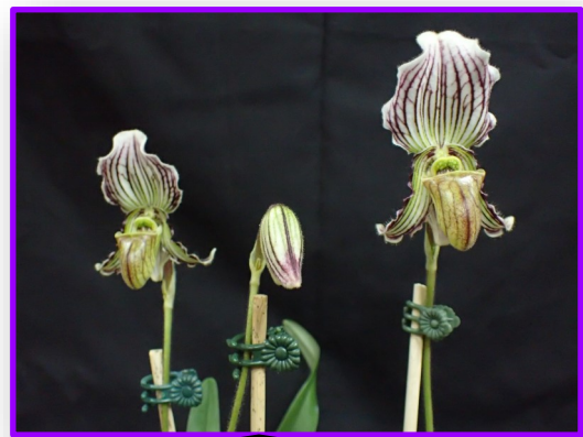
Paph. Fairrieanum 'Ganesh Villa'

Happy Diners: For further information, see Kev Baker or phone 4632 4952