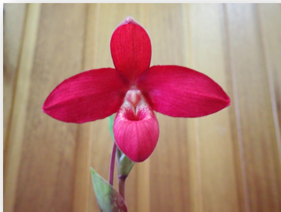
Phrag. Waunakee Sunset x Rosalie Dixler