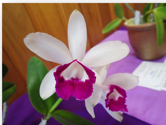
C. intermedia Órlata'