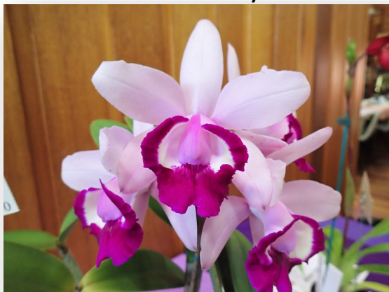
C. intermedia 'Valley View'