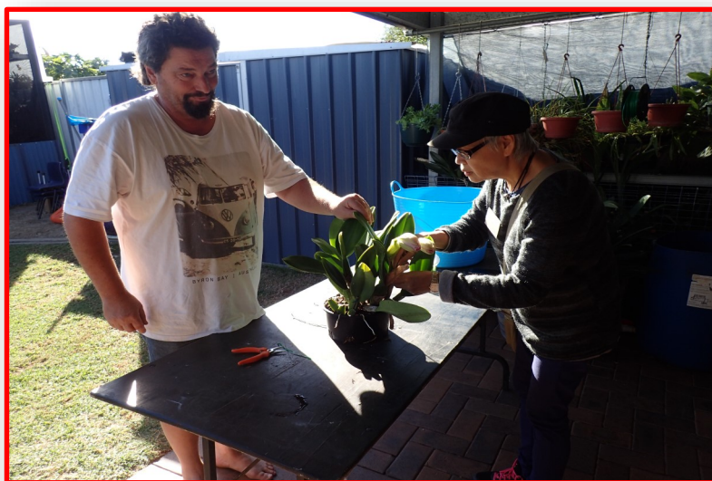
New Growers Group, May 2018