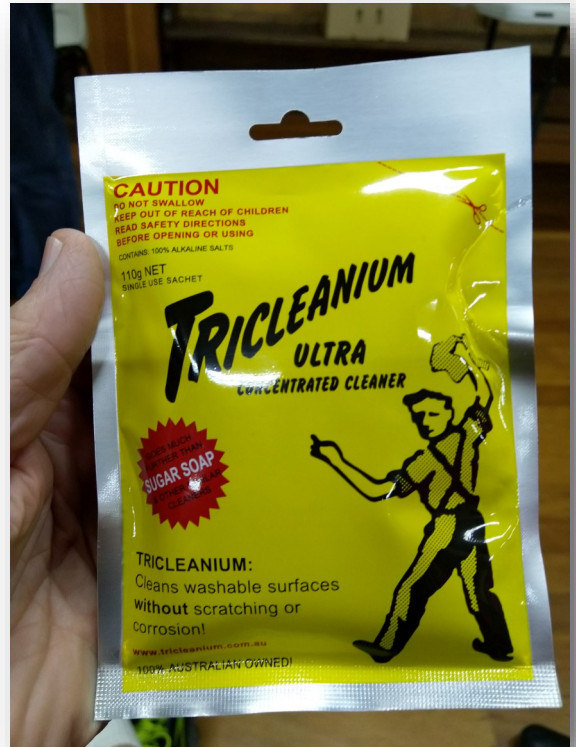
Steriliser for secatuers