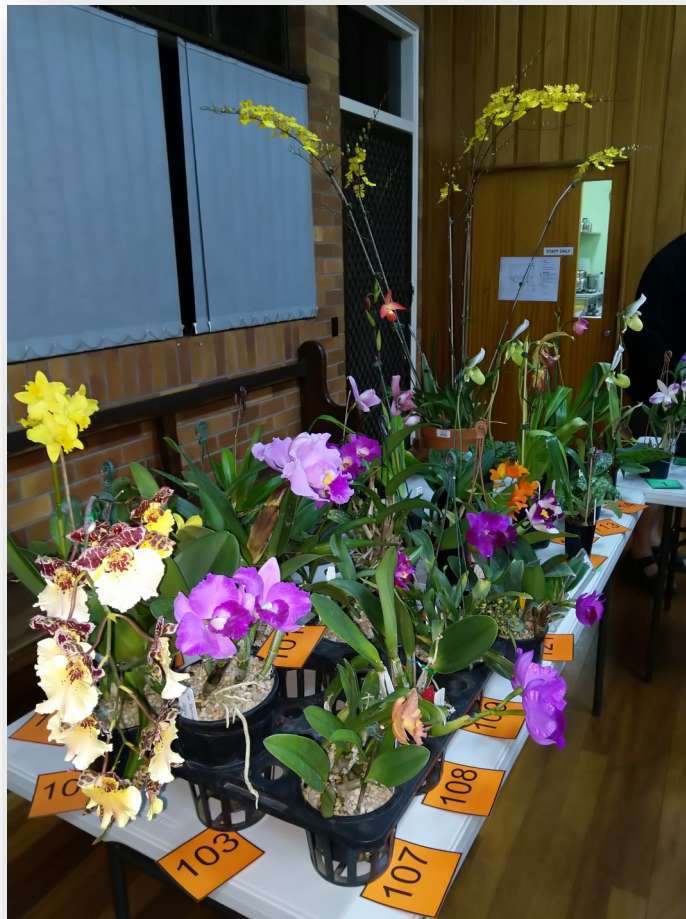
Some of the wonderful benched plants August 2018