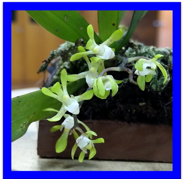
Sarco. Olivaceus