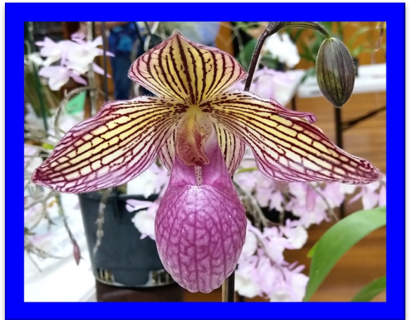
Paph. Gloria Naugle