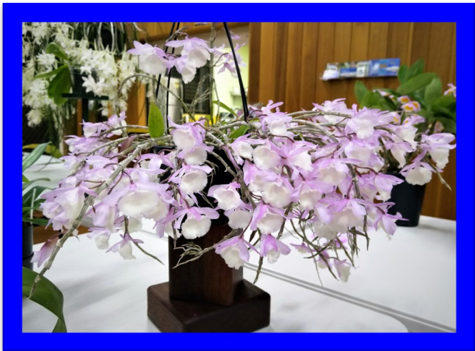
Den. Bohemian Rhapsody