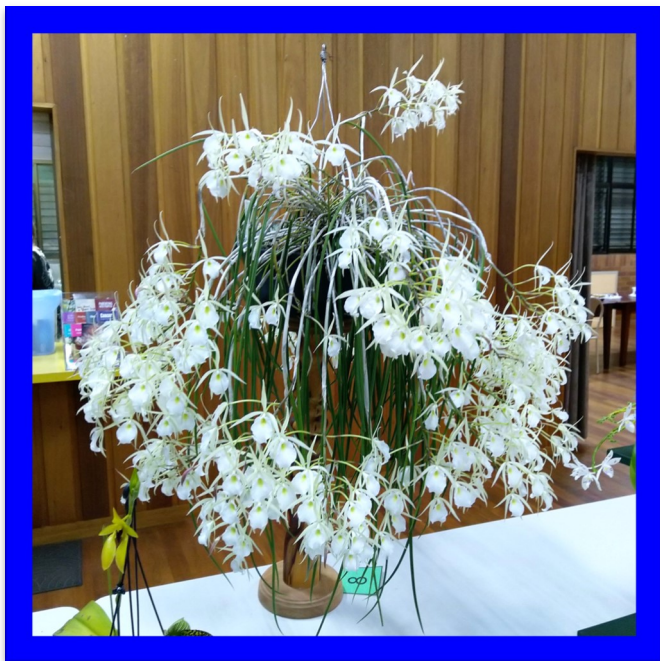
B. flagellaris (C&E Dedekind)