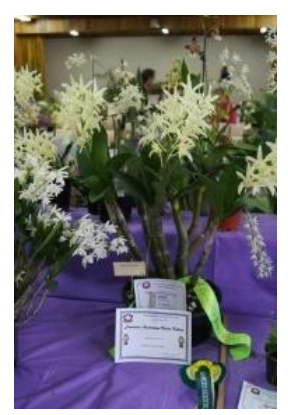
Champion Australian Native Hybrid